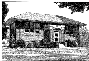
Chatfield Public Library