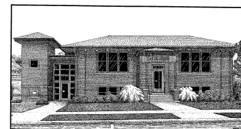
Chatfield Public Library

If you love our historic Carnegie Library, help us