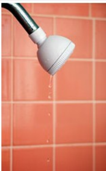
A shower leaking just 10 drips per minute wastes 500 gallons of water per year. That's enough water to run your dishwasher every day for two months!